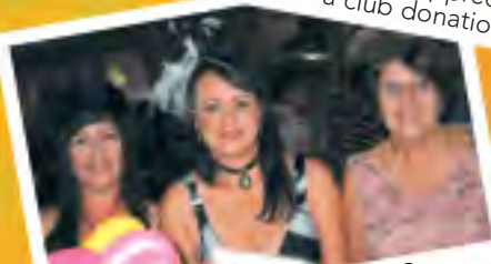
Enjoying the Melbourne Cup Luncheon @ the club