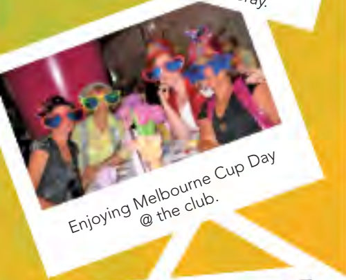
Enjoying Melbourne Cup Day @ the club.